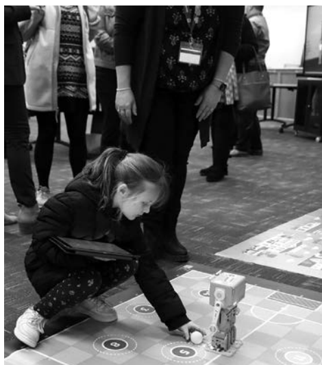
February 2024 Memories: Ken-Ton School District teachers showcasing innovative instructional activities at the second annual Future Ready Project Showcase.