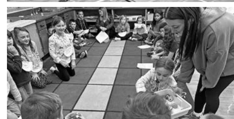
March 2024 Memories: Top photo, "Purple Day" at Holmes for epilepsy awareness (this year, it's March 26th). Middle photo, the 2nd annual Franklin Middle vs. Hoover Middle volleyball tournament. Bottom photo, Kenmore West Girls Leadership Academy mentoring Hoover Elementary students.