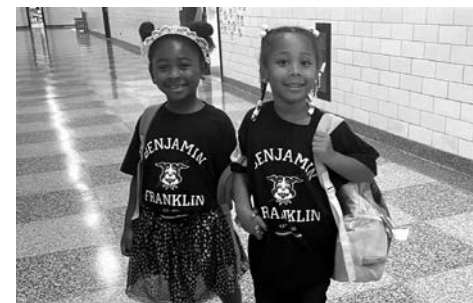
September 2023 Memories: Top photo, the Lindbergh Elementary Welcome Back Assembly. Bottom left photo, the Holmes Elementary Welcome Back Celebration. Bottom right photo, two Franklin Elementary students with their new school T-shirts.