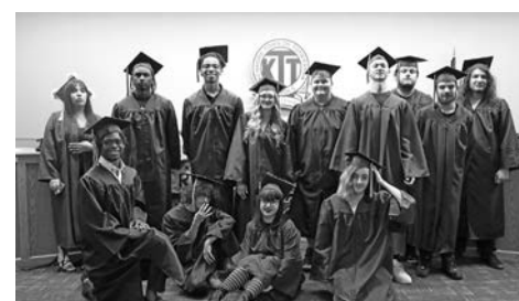
June 2024 Memories: From top to bottom, the Big Picture graduation, Kenmore East graduation, Kenmore West graduation, and Crossroads Academy graduation.