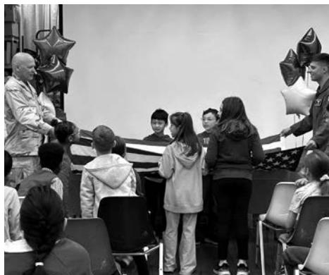
November 2023 Memories: Left photo, Veterans Day at Hoover Elementary School. Right photo, Hoover Middle School's first-ever Turkey Trot.