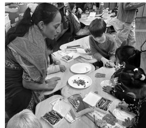
November 2023 Memories: Lindbergh Elementary students learning about Diwali (this year, it is Oct. 31-Nov. 1).