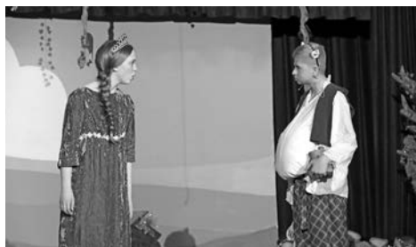
April 2024 Memories: Top photo, Kenmore East students preparing for the East Side Orchestra Concert. Bottom photo, the Hoover Middle School musical, "Shrek Jr."