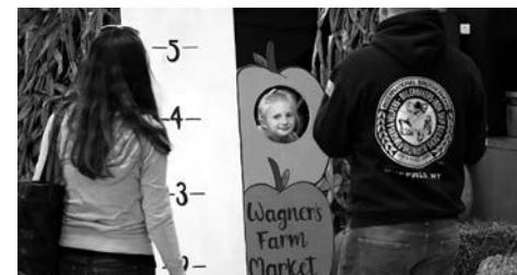
October 2023 Memories: The District Harvest Festival at Edison Elementary.