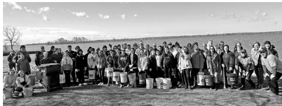
April 2024 Memories: Students, families, and staff clean up the Ken-Ton School District's adopted section of the Niagara River Greenway Shoreline Trail at Aqua Lane Park.