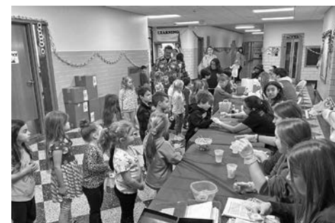
February 2023 Memories: Top photo, Kenmore East's annual Mid-Winter Wing Ding street hockey tournament. Middle photo, Kenmore East band students parading through the halls for Mardis Gras. Bottom photo, students having their fingers painted purple for Purple Pinky Day at Edison Elementary to support Rotary International's efforts to eradicate polio worldwide.