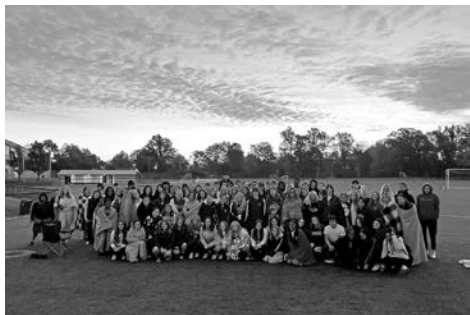
October 2023 Memories: The Kenmore West Senior Sunrise.