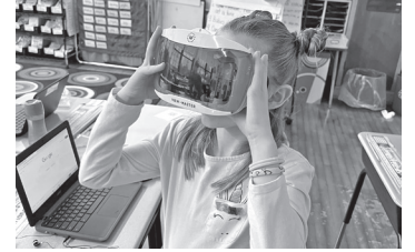
A Franklin Elementary student explores original characters in VR.