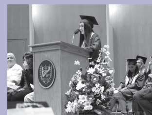
From top to bottom, scenes from the Big Picture Program Graduation on June 17th, the Kenmore East Graduation on June 25th, and the Kenmore West Graduation on June 26th.