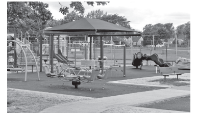
The new adaptive playground installed behind Hoover Elementary School

The final phases of the project, which is expected to be completed in 2025, will encompass significant work at Kenmore East High School. This will include a more secured entrance, new water pipes, a resurfaced parking lot, and a new bus loop.