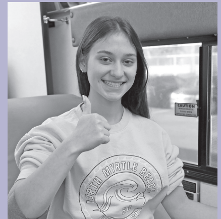
A Kenmore East High School student participates in the first ConnectLife blood drive of the year at Kenmore East on November 3rd. ConnectLife nominated Ken-Ton for the Chamber of Commerce Large Business of the Year Award.

These projects, plus other instructional resources created as part of the Smart Start grant program, will be available on our district website for all NYS educators at www.ktufsd.org/SmartStart .