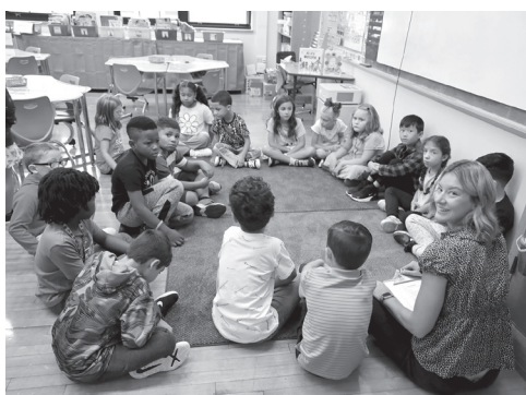
A Franklin Elementary class on the first day of school

In the Ken-Ton School District, support staff earn competitive pay plus benefits including NYS retirement for some positions as well as sick days and holidays. A variety of work schedules are available, ranging from 3 to 8 hours per day and including weekdays, weekends, and split schedules. Most positions offer the opportunity to work family-friendly hours (the same schedule as school-age children – no nights, holidays, weekends, or summers). Additionally, the district offers a signing bonus of up to $1,000 for bus drivers.