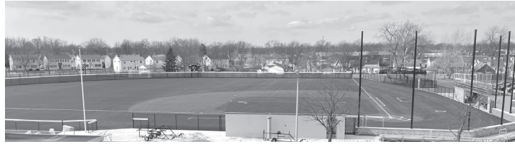
New artificial turf athletic field at Kenmore East High School

of all abilities (located at Hoover Elementary)