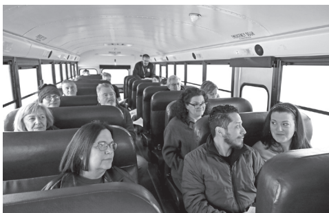
Residents participate in a tour of the district on January 28th followed by a breakfast with Board of Education members.

The 90-minute tour includes dozens of locations of historical significance in areas