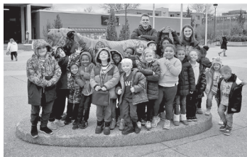
Holmes students visit Buffalo State.

For three school years, Holmes and Buffalo State University have engaged in a Professional Development Schools (PDS) partnership. It's an idea that started with teaching and learning literacy in the classroom and has evolved into different layers of teamwork and collaboration. The two schools started collaborating in early 2020 and since then, Holmes has welcomed several students every semester to observe, learn, and teach. Last semester, 11 future educators and literacy