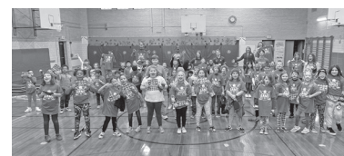
A Hoover Elementary PE class poses with representatives of the Sabres.

Hoover was chosen to be the pilot school for this new initiative, which will soon be launched in 40 schools across Western New York. The goal of the program is to get students interested in the sport of hockey. As part of this program, members of the Buffalo Sabres organization were at