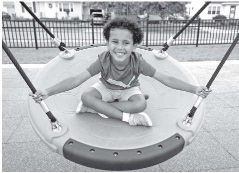
A pre-kindergarten student enjoys the new and improved playground at Hamilton.

Kindergarten programs are offered in all five Ken-Ton School District elementary schools. To be eligible for kindergarten during the 2023-24 school year, children must be five years of age on or before December 1st, 2023. The kindergarten curriculum encompasses engaging, hands-on, rigorous instruction for the whole child including math, ELA, science, social studies, music, art, physical education, and health.