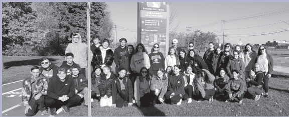
Students pose for a photograph after cleaning up the Shoreline Trail on October 22nd.

You can learn more about the Safety and Engagement Team and meet the new School Safety Officers at www.ktufsd.org/SET .