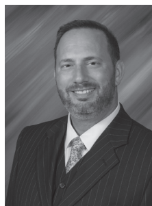
Sabatino Cimato, Superintendent of Schools

District personnel and the Board of Education worked hard to prepare a spending plan for next year which contends with record-high inflation while minimizing the impact on property tax payers. The budget proposal includes a proposed tax levy increase that is below the 18-year historical average and within the tax cap. Keeping the property tax levy underneath the tax cap was a major priority for the district