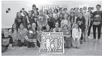
Best Buddies Club at Kenmore East

Best Buddies, now in its fourth year at Kenmore East, is dedicated to creating opportunities for students with disabilities. Kenmore East