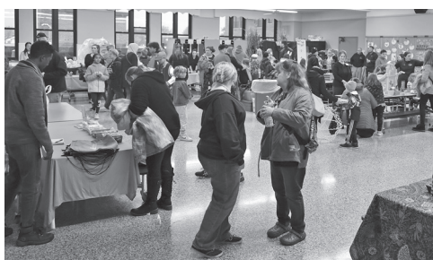
Hundreds attend the District Harvest Festival at Edison Elementary on October 20th.