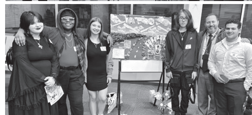
Top photo, the Kenmore West team; bottom photo, the Big Picture Program team.